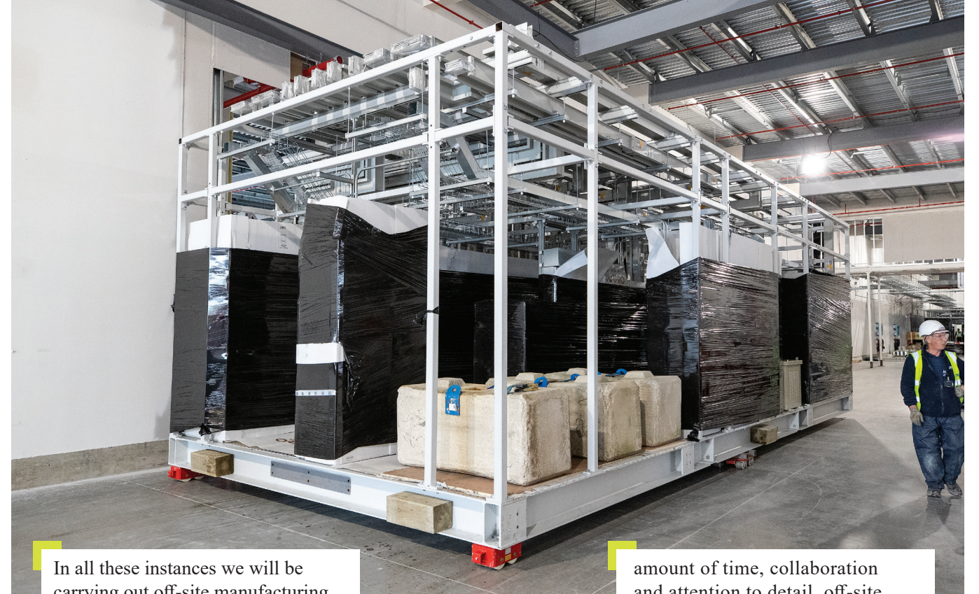
Installation of Modules

In all these instances we will be carrying out off-site manufacturing.